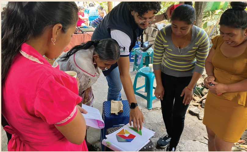
Women work together to complete the Tangram exercise. Women are members of the Women in Action in Olopa, Chiquimula, Guatemala, which received their initial grant from Right Sharing in 2025.

In Guatemala, the Right Sharing of World Resources team intentionally nurtures teamwork and community in places where connection doesn't always come easily. For many women, the group itself is their most reliable source of support—often the people they can lean on when resources are scarce.