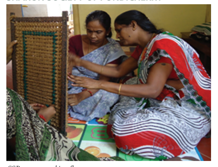
SSP women making floor mats

Sharon Society of Pondicherry (SSP) in India is a group that works with people with intellectual and developmental disabilities. The NGO runs a school for intellectually disabled children, and has also formed a self-help group for the children's mothers, many of whom were living in poverty. SSP supported the mothers to start income-generating activities that they could do from their homes so they wouldn't have to leave their children while they worked. The mothers collectively decided to take up floor mat production. This was a particularly smart choice, because there are many textile mills in the area and they use the waste from the mills to make the mats. The project has been very successful. All 24 of the initial beneficiaries have repaid their loans in full, and 40 new women have received loans from the repaid funds. In addition, the women have been able to make repairs to their homes, pay off old loans to money lenders, and buy nutritious food for their children. Most importantly, they have a home business they can do while caring for their children.