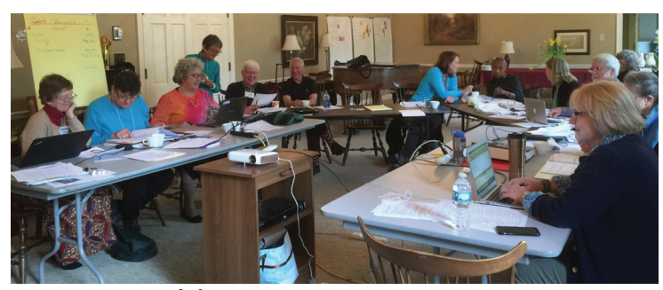
Spring 2017 Board choosing projects

In India, the projects chosen include 12 groups with a wide range of businesses: selling tea and crunchy rice snacks at a local train station, organic farming, photocopy services, tailoring, and several others. The businesses are limited only by the imagination of the women entrepreneurs and the local market!