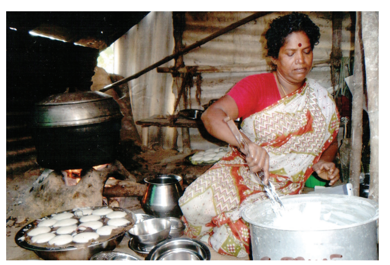
Woman in India making idly rice cakes

You could make sukuma wiki from Kenya, which means "stretch the week." Kenyan women make this dish of greens, onions, and tomatoes at the end of the week to serve with ugali ( corn mush ) when all of the other food is gone. You could also try to make idly breakfast rice cakes from India, which many of