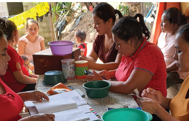
La Bendición Women's Group meeting to discuss saving and loans. They are located in La Pinalito, Chiquimula Department, Guatemala.