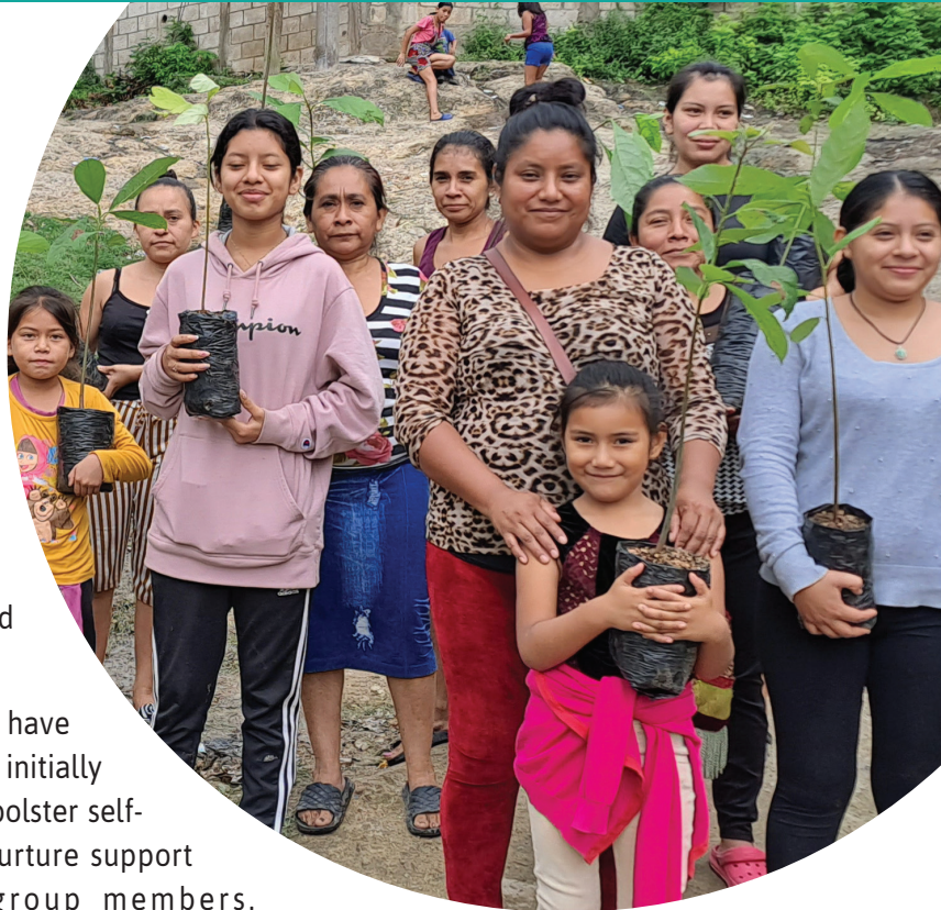
Members of La Bendición Women's Group with their children holding avocado plants.

Six new women's groups have already been identified to receive training in the future. The RSWR team continues to conduct outreach to the many villages in Chiquimula, in hopes that additional women will form self-help groups and apply to partner with RSWR. This milestone was made possible by the tenacious efforts of each woman in these partner groups and through the essential donations from partners around the world. Thank you for joining RSWR on this journey rooted in a spirit of abundance and equity.