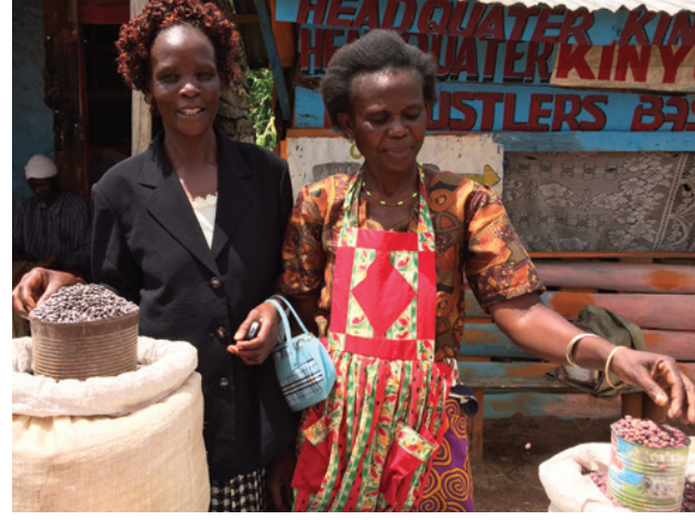
Continued on page 3 Daughter and mother selling grain and beans at local market

during Sunday social time, but she soon realized that it would take too long to raise funds for a project with this effort alone. So a small, informal committee was charged with finding additional ways to fundraise. The group organized a concert with two choirs, which was a great fundraiser and social success. They made successful applications to two Irish Quaker Funds – Irish Quaker Faith in Action (IQFA) and Dublin Monthly Meeting Concerns Fund. Recently, they provided lunch for about 40 Friends who were attending Yearly Meeting committee meetings. Little by little, they raised enough funds to sponsor four RSWR projects. Continued on page 3