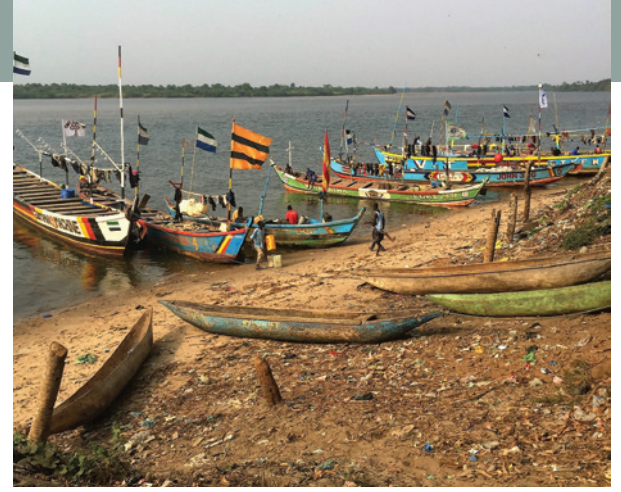
Fishing boats GCDF