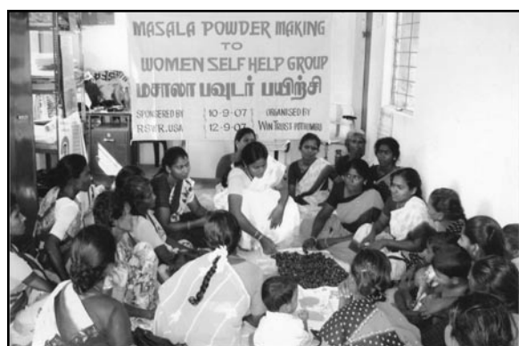
WIN's masala powder-making training.

From WIN's most recent report, "For the second year of the project, we have selected 60 women, 10 women in six groups. Each group receives training in one of five skill areas; thatch-weaving, nursery-raising, vermi-compost preparation, pappadam and pickle-making, masala powder-making. Each woman received a loan of Rs. 3,000 [$75]."