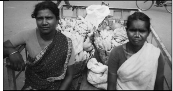
Two SD members taking produce for sale.

VARIOUS (EIGHT) INCOME-GENERATING PROJECTS