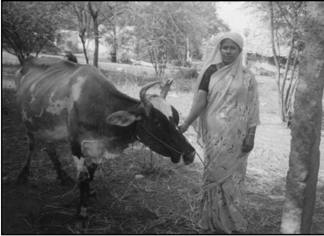
WORD member proudly displaying her cow.

ECONOMIC SUSTAINABILITY OF MUSLIN WOMEN THROUGH RURAL WOMEN’S MILK SOCIETY